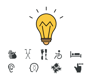
Innovations and inventions by people with disabilities