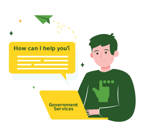
Government service platforms for the disabled.