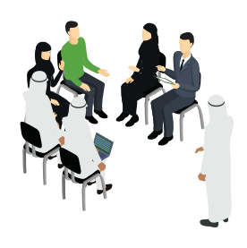
Specialized workshops & panel sessions in disability and rehabilitation.